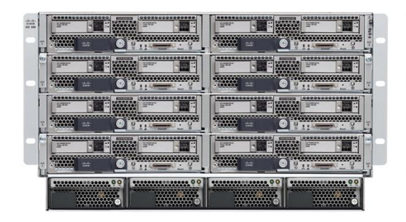
Figure 2. Cisco UCS 5108 Blade Server Chassis with Blade Servers Front and Back

Four hot-swappable power supplies are accessible from the front of the chassis, and single-phase 2500 W AC, 2500 W –48 VDC, and 2500 W 200 - 380 VDC power supplies and chassis are available. These power supplies are up to 94 percent efficient and meet the requirements for the 80 Plus Platinum rating. The power subsystem can be configured to support nonredundant, N+1 redundant, and grid-redundant configurations. The rear of the chassis contains eight hot-swappable fans, four power connectors (one per power supply), and two I/O bays that can support either Cisco UCS 2000 Series Fabric Extenders or the Cisco UCS 6324 Fabric Interconnect. A passive midplane provides up to 80 Gbps of I/O bandwidth per server slot and up to 160 Gbps of I/O bandwidth for two slots. The chassis support 40 Gigabit Ethernet standards with the 2304 Fabric Extender.