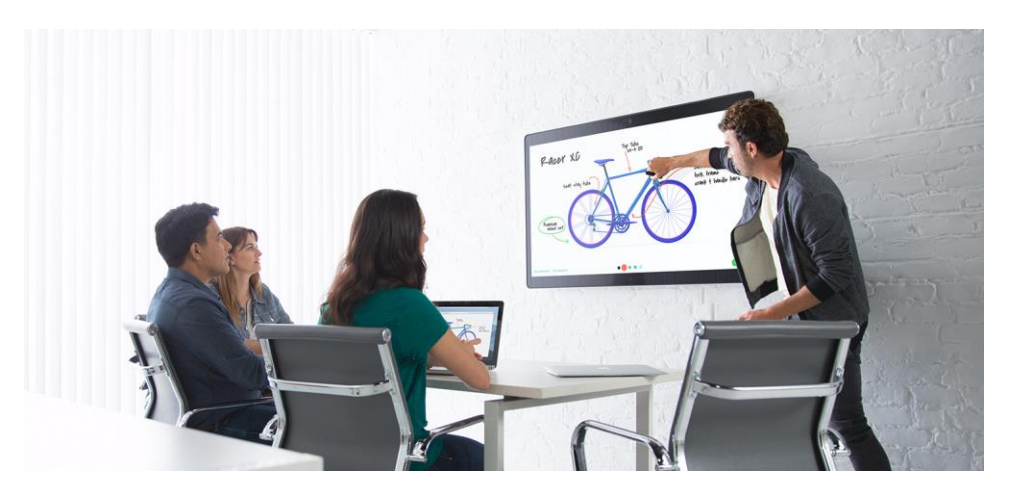
Figure 1. White Boarding Capability on the Cisco Webex Board 55

The Cisco Webex<sup>™</sup> Board is an all-in-one device that provides everything you need to collaborate with your teams in physical meeting rooms. You can wirelessly present, white board, and have video and audio calls. And it securely connects to your virtual teams through the Cisco Webex service, via your Cisco Webex Teams appenabled devices, so you can take your meetings and content on the road.