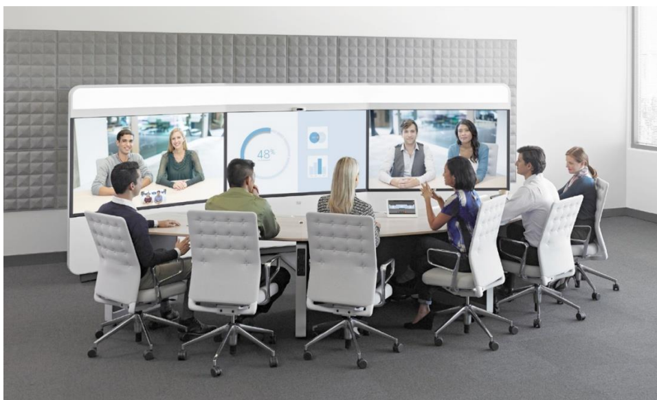
Figure 1. Cisco IX5000, Six-Seat System

This sleek and powerful system incorporates an elegant triple 4K Ultra High Definition (UHD) camera cluster, three high-definition 70-inch LCD screens, and theater-quality audio to bring people together as if they were just across the table. The IX5000 Series includes the single-row, six-seat IX5000 system, and the dual-row, 18-seat IX5200 system.