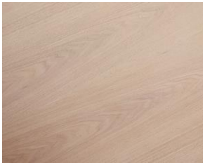
Figure 3. IX5000 Series Walnut Table Wood Option