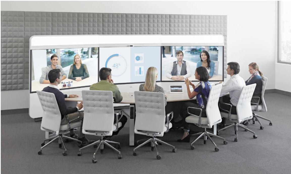
Figure 1. Cisco TelePresence IX5000, Six-Seat System

This sleek and powerful system incorporates an elegant triple 4K Ultra High Definition (UHD) camera cluster, three high-definition 70-inch LCD screens, and theater-quality audio to bring people together as if they were just across the table. The IX5000 Series includes the single-row, six-seat IX5000 system, and the dual-row, 18-seat IX5200 system.